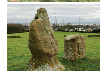
Heston Brake (C Harris)