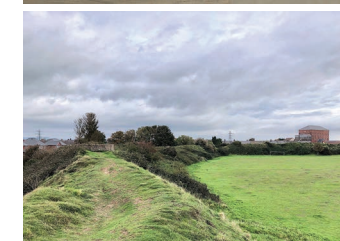
Sudbrook Camp (C Harris)