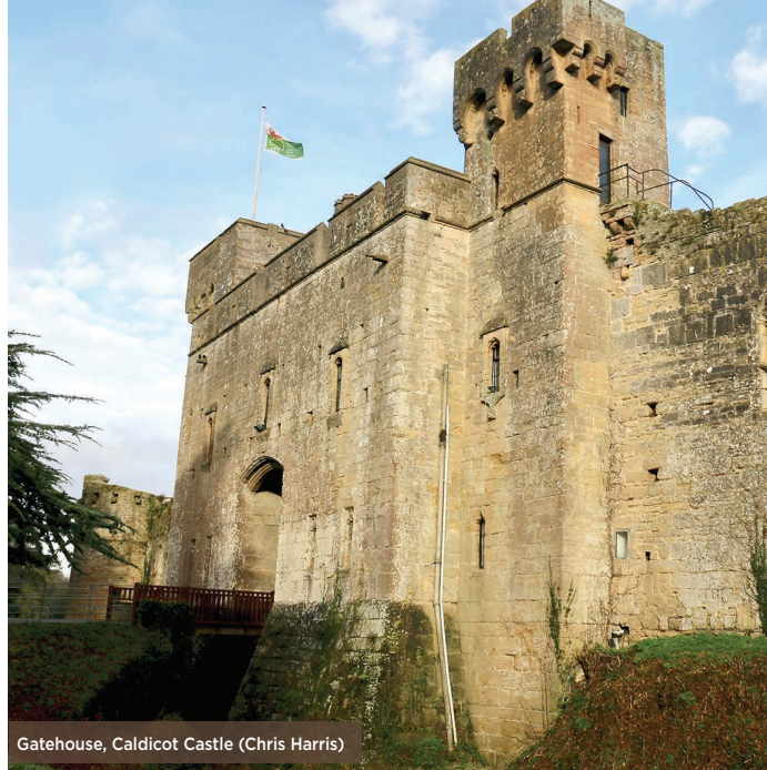
Gatehouse, Caldicot Castle (Chris Harris)

the huge red brick pumping station, built in 1886 to house six beam engines used to pump water from the Severn railway tunnel. Follow the road as it bears to the left, passing some of the houses built in the 1870s to accommodate workers on the Severn Tunnel, and follow to the end of the surfaced road, where the track continues onwards towards Black Rock . Just before Black Rock the path splits; turn right to go through the picnic site, which has fantastic views across the Severn Estuary, or carry straight on towards Black Rock Rd.