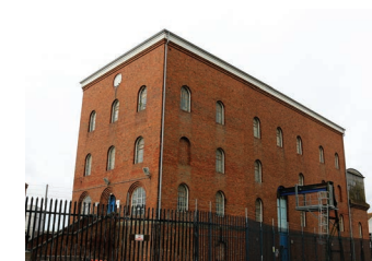
Sudbrook Pumping Station (C Harris)