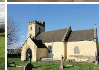
St Marys, Portskewett