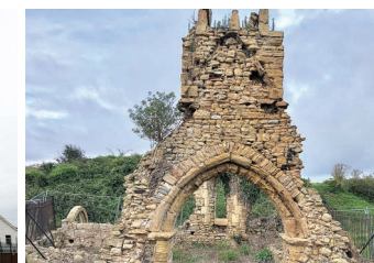
Holy Trinity Church (C Harris)