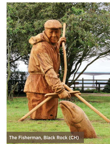
The Fisherman, Black Rock (CH)

At Black Rock picnic site, look out for The Fisherman and The Engineer , two sculptures celebrating the people of the Levels.