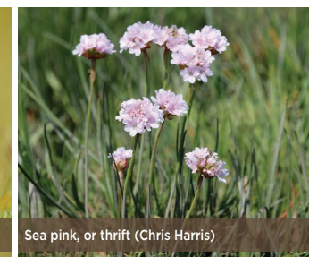
Sea pink, or thrift