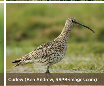
Curlew