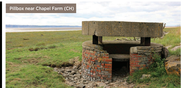
Pillbox near Chapel Farm (CH)