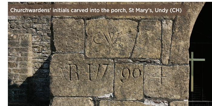
Churchwardens' initials carved into the porch, St Mary's, Undy (CH)