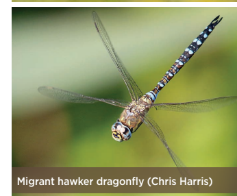
Migrant hawk dragonfly