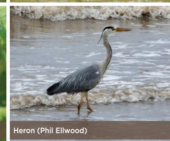
Heron (Phil Ellwood)