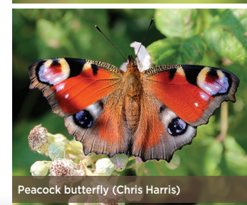
Peacock butterfly