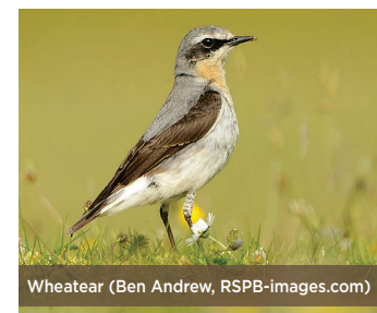
Wheatear