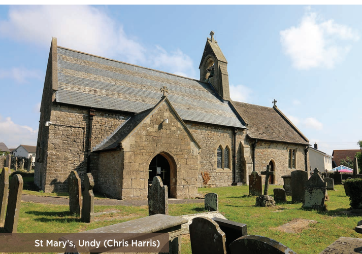
St Mary's, Undy